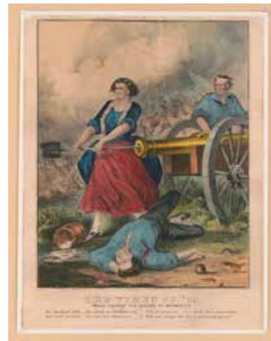
Molly Pitcher the heroine of Monmouth

Native American tribes and enslaved people joined different sides based on what was in their best interest. The Mohawk Tribe in New York sided with the British in the war because the British were keeping the colonists from expanding into their land. A free Black man named Crispus Attucks joined the American resistance against the British and was the first to die in the events leading to the American Revolution. Later, British leaders even offered enslaved people freedom after the war if they were willing to fight against rebelling colonists. In addition, about 5,000 Blacks fought on the American side.