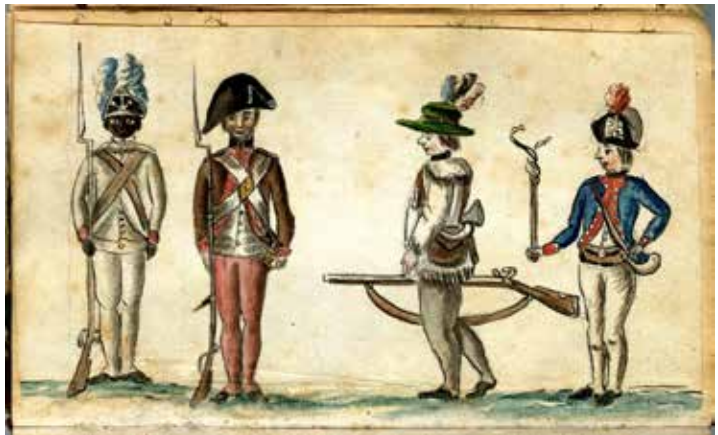
Soldiers in Uniform

The American Revolution was an important time when the thirteen colonies decided they did not want to be ruled by Britain anymore. In 1776, they courageously said they wanted to be independent and started a fight for liberty. This war would be very hard for the Americans. Britain had the strongest military in the world and lots of resources. The odds were against the Americans. While the battles were raging, other important events were occurring, and ordinary Americans were trying to live their lives as normally as possible.